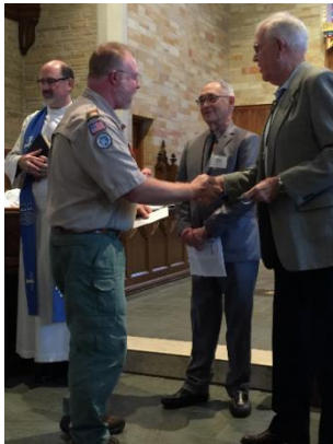
The Boy Scouts receive a contribution from the Brotherhood of St. Andrew.